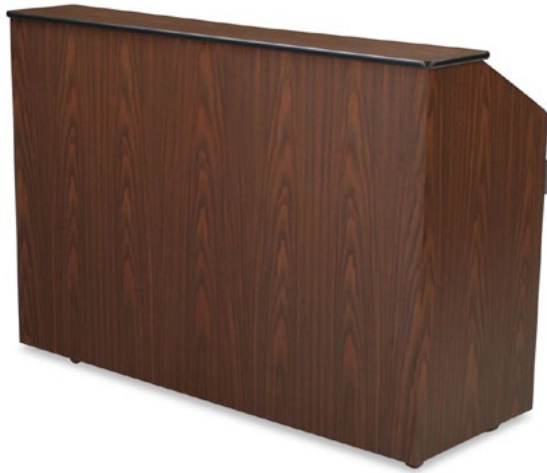
4847-6 Foot Mobile Bar (5ft, 6ft or 8ft) High Pressure Laminate Open cabinet with stainless steel work counter, sink with drain, two speed rails and four 5" grey wheels. 188 cm x 66 cm x 123 cm 140kg